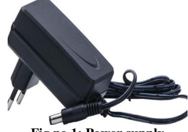
Fig no 1: Power supply

The present chapter introduces the operation of power supply circuits built using filters, rectifiers, and then voltage regulators. Starting with an AC voltage, a steady DC voltage is obtained by rectifying the AC voltage, then filtering to a DC level, and finally, regulating to obtain a desired fixed DC voltage. The regulation is usually used for regulate the voltage from an IC voltage regulator unit, which takes a DC voltage and provides a somewhat lower DC voltage, which remains the same even if the input DC voltage varies, or the output load connected to the DC voltage changes.