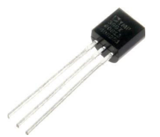
Fig no 8: Temperature sensor